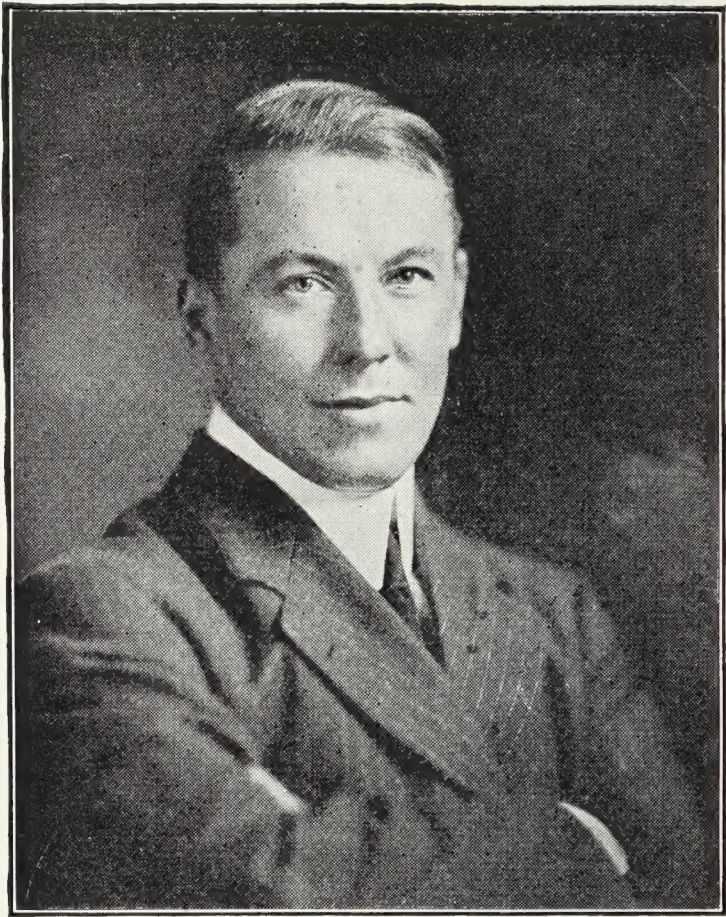
Robert W. Service